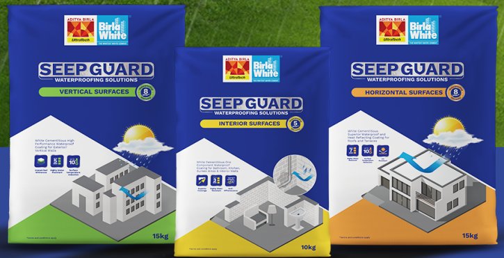
Vertical Surfaces Interior Surfaces Horizontal Surfaces